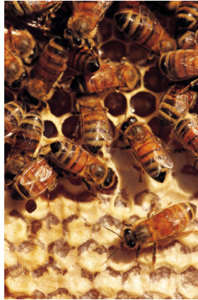
Honey bees in their colony

queen. They are not responsible for anything else. They do not collect pollen. If a colony is short on food it is the drones that are made to leave.