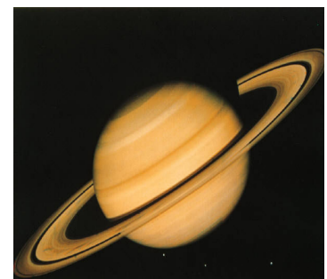
The planet Saturn

with ice. It was discovered in 1930. Pluto's surface consists of 98% nitrogen, methane, and a small bit of carbon monoxide. It's moon is called Charon. It is the only moon to rotate in a synchronous orbit with it's planet. Pluto was named for the Roman God of the Underworld. The planet is approximately 3 billion miles from the sun.